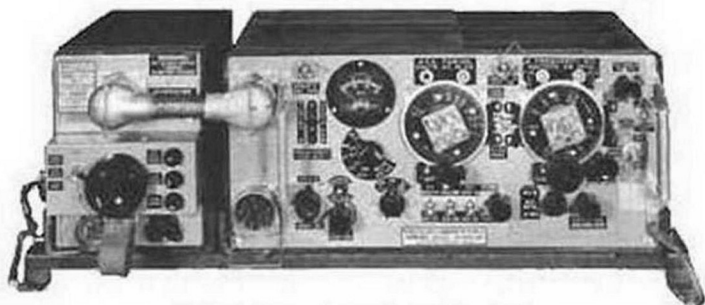
WS No. 19 Mark III